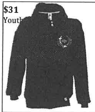
Cotton Zip-Up Hoodie