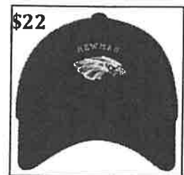
Stretch Mesh Cap